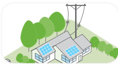
Residential, backup power and grid-tie